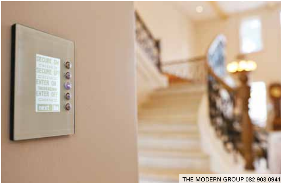
THE MODERN GROUP 082 903 0941