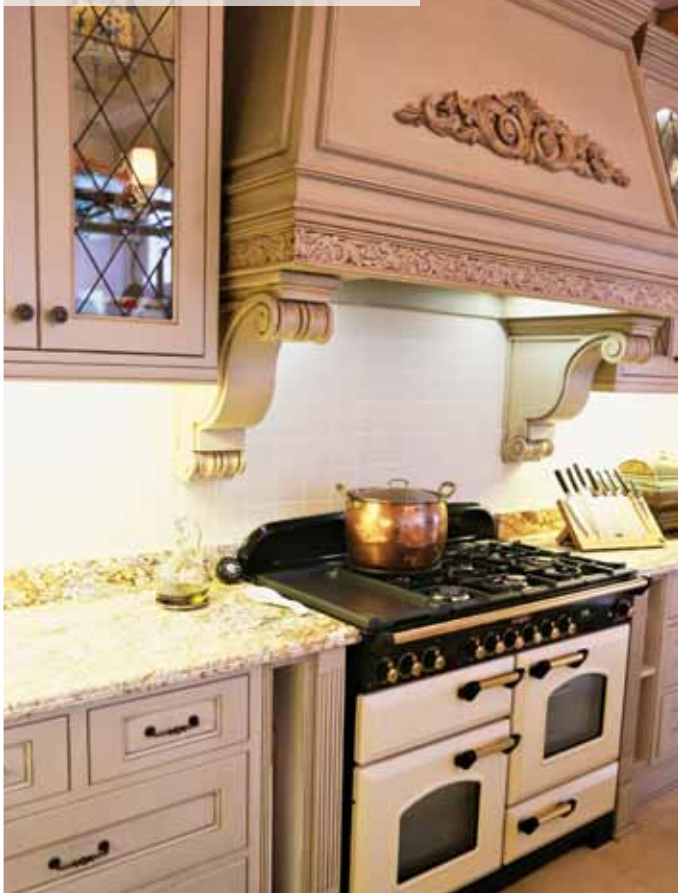
NATURAL STONE WAREHOUSE 021 506 1300