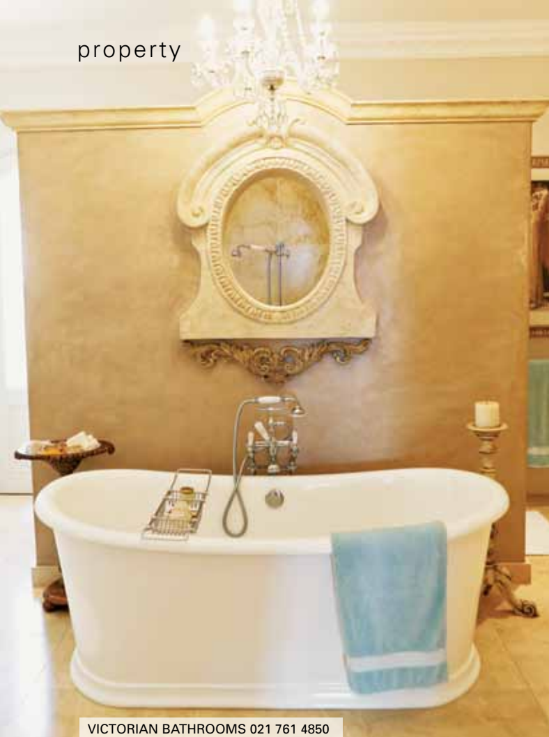
VICTORIAN BATHROOMS 021 761 4850