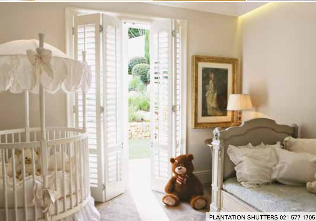
PLANTATION SHUTTERS 021 577 1705